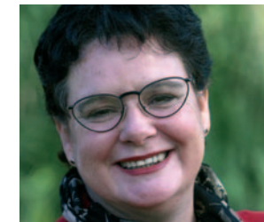
Today's keynote speaker, Sharan Burrow, was elected the first ever female president of the International Confederation of Free Trade Unions (ICFTU) at its Congress in December last year.