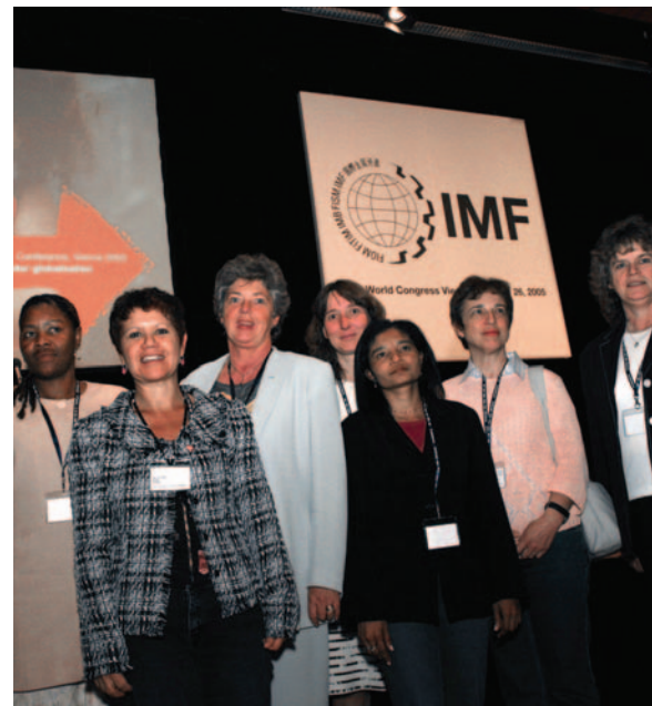
Seven of the eight women elected to the IMF Executive.

Bulletin for the 31 st IMF World Congress, Vienna 2005