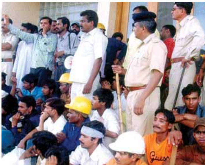
Workers at the Alang/Sosiva shipbreaking yard in India recently showed how collective action works when 20,000 workers downed tools in protest over an attempt by employers to reduce wages to less than €3.50 per day. Despite attempts to obtain injunctions to prevent union officials from entering the yards, the employers were forced to concede to worker demands.

During the event, the IMF will launch its response to the European Commission's public consultation on the options for new initiatives regarding the dismantling of ships. The IMF is demanding an end to the exploitation and needless killing of workers in this industry by ensuring that any new international regulation addresses workers' concerns and raises global standards.