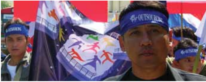
IMF affiliates around the world took part in a global day of action against precarious work. Pictured: Thai affiliate, TEAM